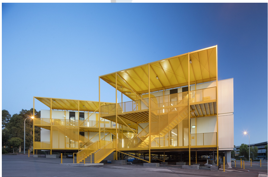
Monash University Learning