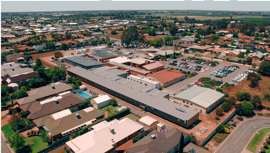
Shepparton Private Hospital